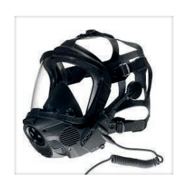
3rd Party BA Supports 3rd Party BA comms kits