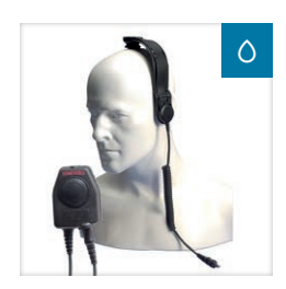
CXR5/950/DT* Bone conductive skull mic with in-line PTT