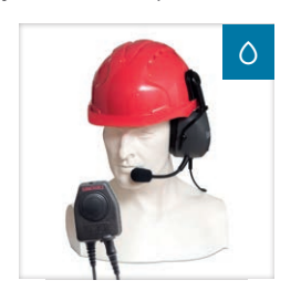
CHP950HS/DT* Single sided ear defender headset for hard hat use